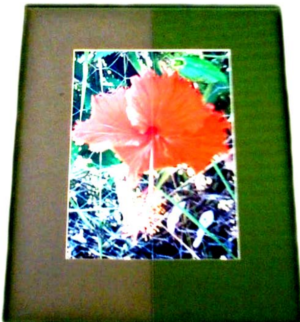
Split display Plain glass Guardian UV

Come on, give me a call . . . I want to help you do this !