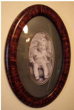
◀ Walnut tortoise shell, mini oval