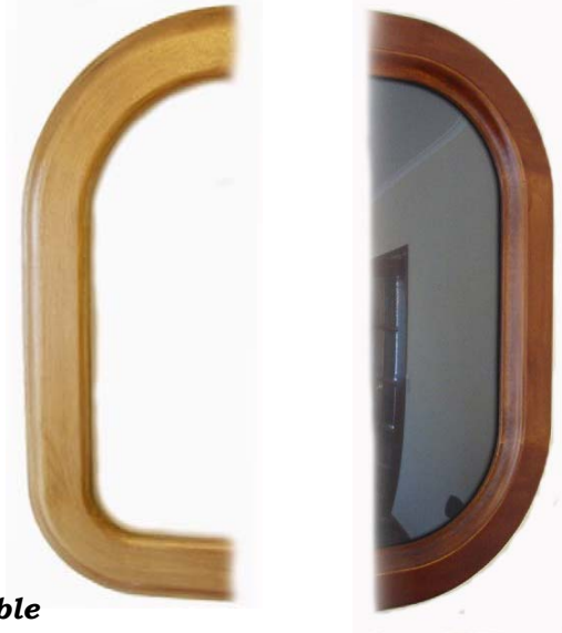
▼ Baltic stain